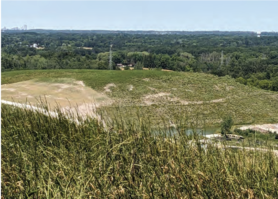
Stock pile used this summer