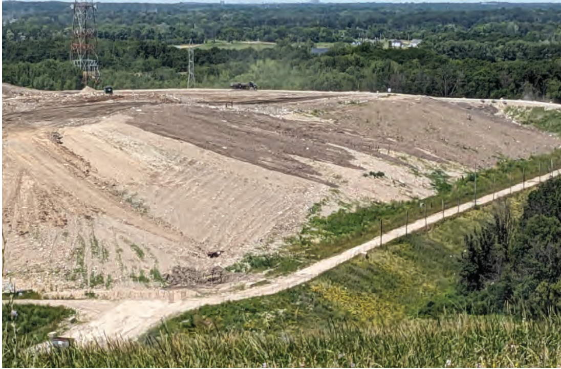
East slope of Phase1