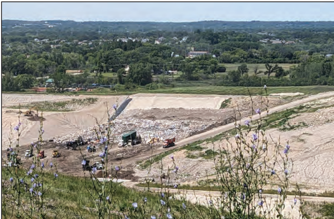
Phase 3 with large working face in middle of Phase