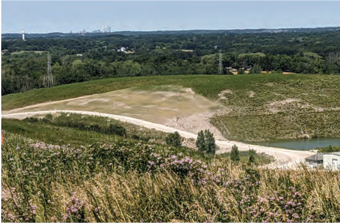
Stockpile re-vegetated after use