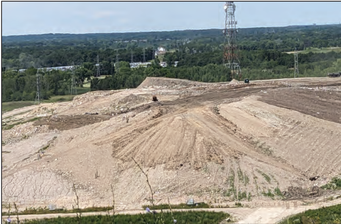
Phase 1 & 2 still receiving additional intermediate cover