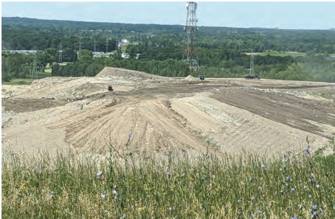
Phase 1 & 2 still receiving additional intermediate cover