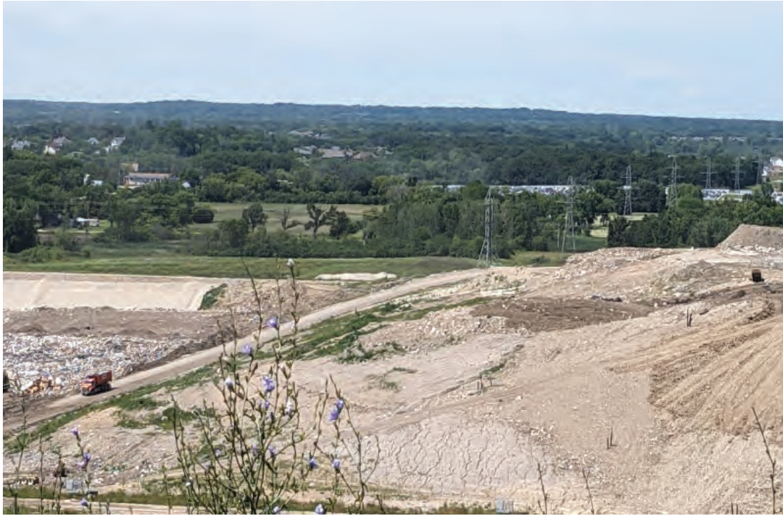
West edge of Phase 2 and transition into Phase 3